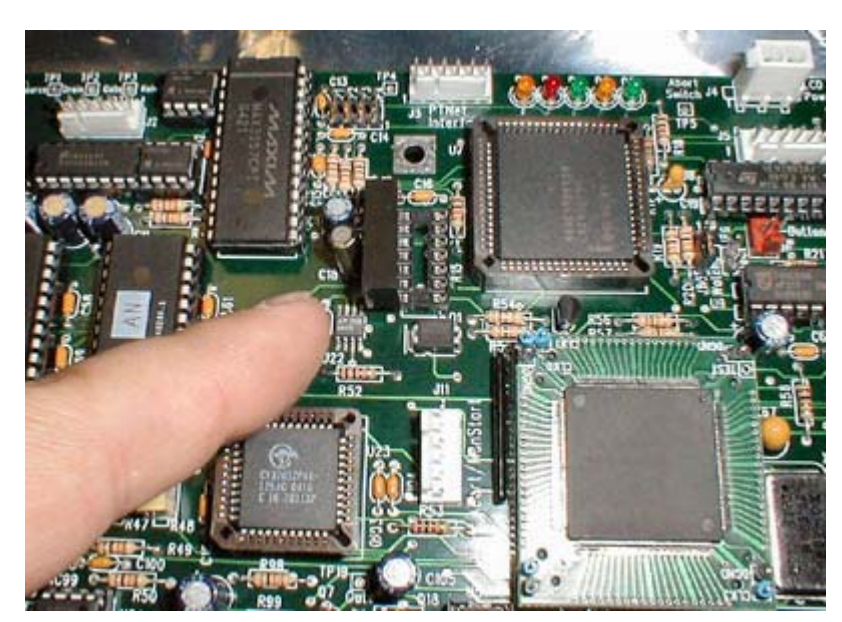
Figure 2: Handler Power Supply PS3 Board Location - Enlarged